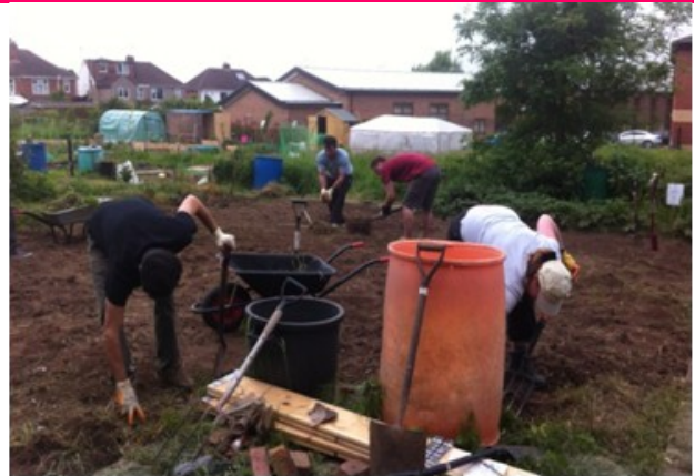
Volunteers at Cheylesmore allotments

The Coventry 4 Good team helped to kick off the promotion of the Coventry Fun Run in June 2015. Coventry 4 Good recruited volunteers to help marshal at the event or to help raise funds for good causes in Coventry at the run on 4 th October 2015. This regular event hosted by Coventry Three Spires Round Table is the ideal opportunity for families, work colleagues, friends and neighbours to get together to show their support of voluntary and community groups in the