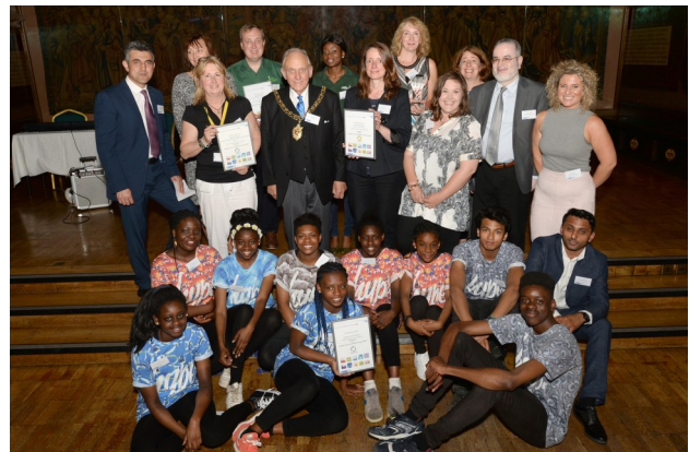
Winners and runners up in the Voluntary / Community (large) category at the Community Cohesion Awards

The award is presented to organisations that demonstrate how their activity contributes to Community Cohesion; Including how the activity brings people from different communities together; the benefit to participants engaged in the activity – particularly with regard to changes in attitude and the successes or achievements of the activity in terms of community cohesion.