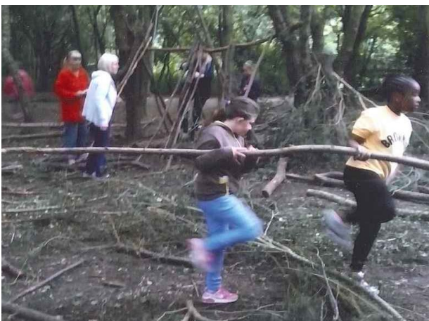
26th Coventry Brownies have a go at den building

The Coventry 4 Good initiative ensures that all the money raised in Coventry stays in Coventry and goes towards helping small volunteer led groups continue their work.