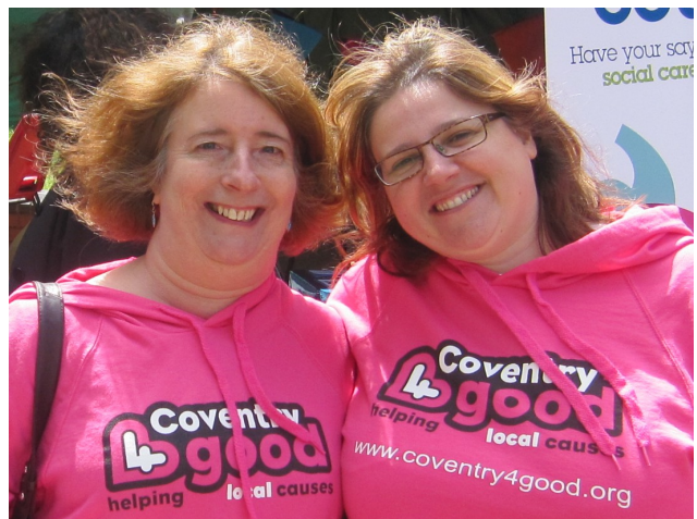
Coventry 4 Good fundraising and promotion at the Community Information Fair 2015

And during the Easter holidays in April, shoppers at Morrison's on Holyhead Road dug deep and donated £180.57 in return for help with their packing. It was great to meet and chat with so many of Coventry's residents, and we would like to give a huge thank you to staff and shoppers at both stores, and of course to all of our volunteers.