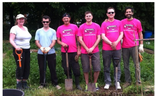
The Perkin Elmer Team

The Perkin Elmer volunteers had come from a range of towns across the country to take part, and enjoyed the chance to get to know a Coventry community whilst also enjoying meeting up with colleagues and team-building. They commented: "Seeing what we had achieved at the end of the day was extremely rewarding. We wish the local community all the best and hope the plot proves to be very fruitful."