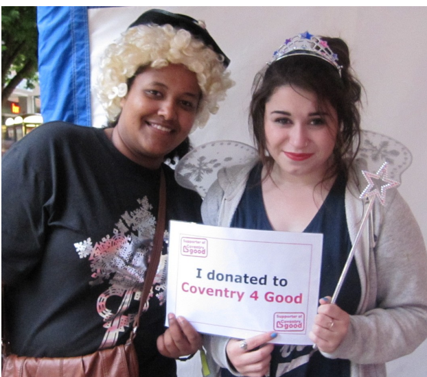
Coventry students show their support at the Student Shopping night 2014

The shoppers of Coventry showed their generosity at Bag Packs run by Coventry 4 Good to raise money for organisations in the city.